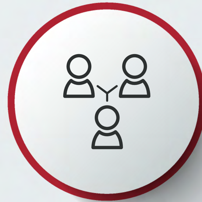
Sustainability on customers and collaborators