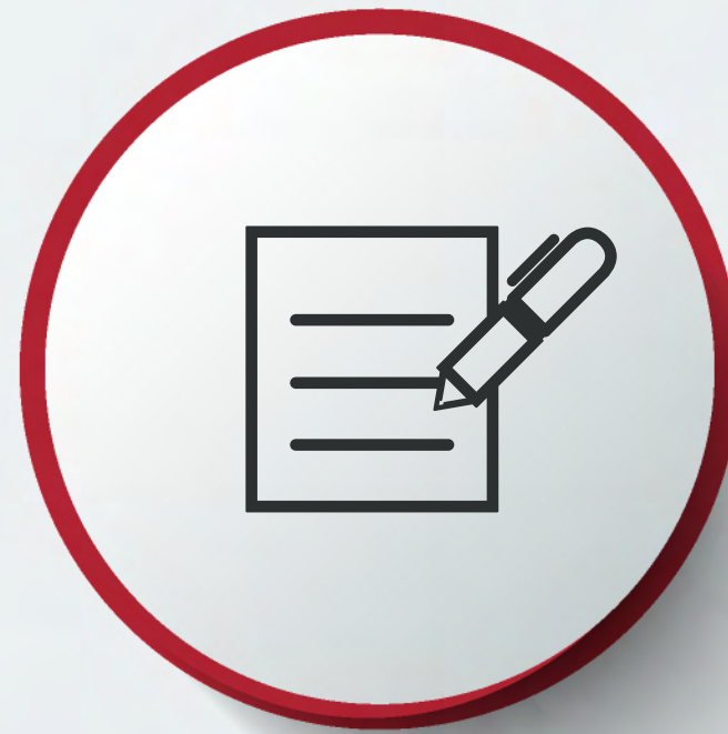
Scope of Services